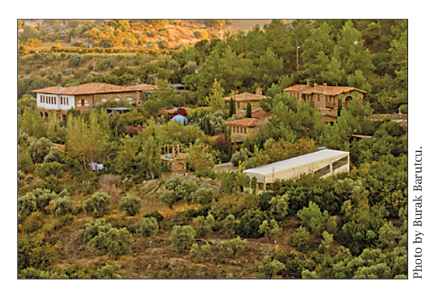
The Village from afar. The two blue domes (one of which is almost hidden) are the female and male Turkish baths. The large white building on the right is the library.