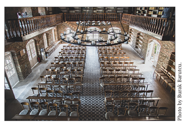
View of the library conference hall from the second floor.

Ordinary high school education in Turkey is geared toward the university entrance examinations. As a result, the emphasis is on memorization, mindless competition, and end result rather than thought processes. The Mathematics Village aims to counteract this by giving high school students a glimpse of what university-level mathematics is.